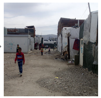
The first of two camps visited in March

With a Lebanese population of four million, Lebanon is currently hosting over one million Syrian refugees from the violence in Syria that has torn that country apart. I wanted to touch in with the human stories of these people, and so I traveled to Lebanon in March of this year (2016) in hopes of visiting one or more of the refugee camps that have sprung up all over the country. Most of the camps are humble affairs, taking in from one hundred to one thousand people. The dwellings are typically tent-like structures with large tarps thrown over a wooden frame. Despite the fact that these camps now dot the Lebanese landscape, entry into them is both tightly controlled by the U.N. and not particular safe once you are allowed in, so it was my good fortune to visit two camps and be able to walk around and talk with some of the inhabitants (with the help of a translator).