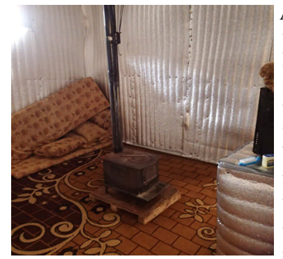
Emptiness: Inside a refugee tent

them across the border to Lebanon. There is no work for these people, no books to read, no activities, just overwhelming emptiness in a sterile environment.