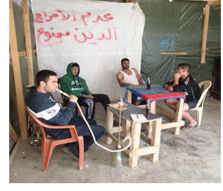
Empty lives: pepsi & plastic

Both camps that I visited were in the Bekaa Valley in eastern Lebanon. The Al Jaraheya camp was a collection of about 30 wood-framed structures housing about 200 people. A dominant theme of the camp that comes to mind is emptiness . This small, lost world is not lacking in people, but it is empty of any social or cultural context or content. For example we took a tour inside one of the "homes"; there was almost nothing in it. There was a rug on the floor, a small stove (but no fuel) in the middle of an approximately 15 by 15 foot room, and a television; other than that it was just open space. An attached side lean-to had a simple sink, drainboard and a single-burner propane stove.