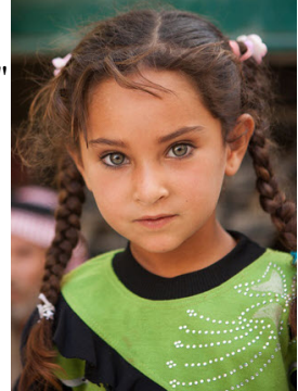
A brief reminder of what we are discussing here: the human family

for victory sign after some recent success in battle, while in the background most of buildings in the town or city depicted lie in ruins, and the former occupants of the dwellings are living elsewhere in refugee camps. More than 400,000 Syrians have been killed in the four-year war, at least one million have been wounded, and an estimated twelve million Syrians (half the population of the country) are refugees, some inside and some outside the country.(1) An entire generation of Syrian children are growing up