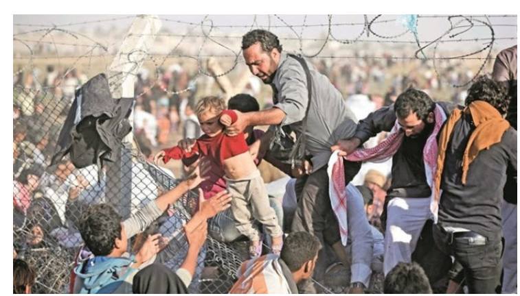
The fruit of American foreign policy in the Middle East: 400,000 dead in Syria and 12 million refugees. It's a similar story in Iraq and Afghanistan.