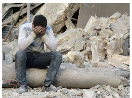
Today Syria is largely destroy; to understand why, read on.

In spite of the ongoing struggle for dominance in Syria by the various factions, there is in fact less and less to dominate, as the country has largely been destroyed by the four-year war raging there. It is commonplace to see a picture of a Syrian army soldier flashing a "V"