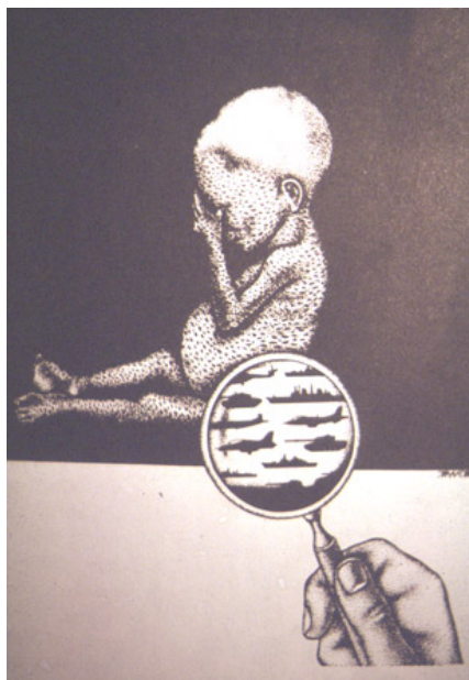
Many of the ills of the world can be traced to the hemorrhage of resources to war