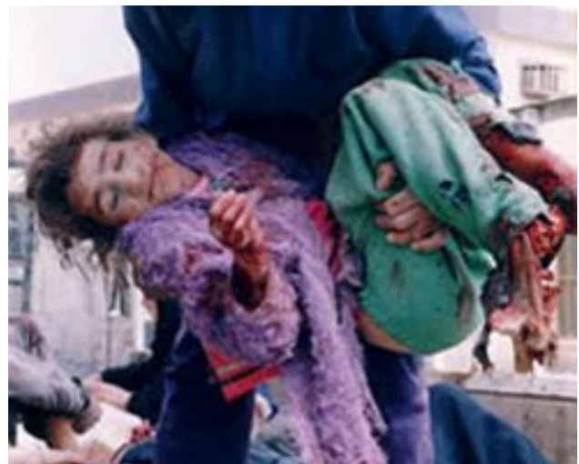
One of the first victims in the current Iraq war, hit by U.S. bombs on March 19, 2003 in the city of Basra.

Do you want to spend your life paying for the death of people (executed by the U.S. military) that you would probably have loved if you had met them? Do you want to spend your life paying for the arsenal of hydrogen bombs that could very well destroy most of the life on the planet? If not, if you want another kind of life, then as author James Howard Kunstler often suggests, “You will have to make other arrangements.” You will have to arrange to live according to your own deepest ethical